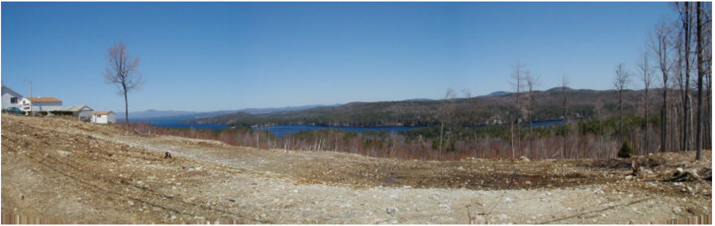
Lake Winnepesaukee, 4/28, during the check run.